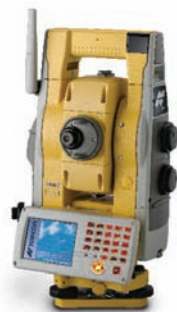
9-SERIES Robotic Total Station System

Topcon's new 9-Series Robotic Systems: Superior Technology – Superior Design – Superior Performance and Value: only from Topcon, the World Leader in Precision Measurement Technology.